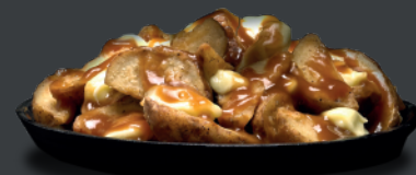
Tater Poutine ™