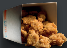
100% White Meat Chicken Pop-Ins ™